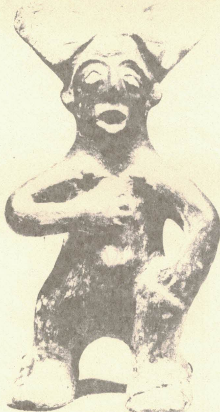
FIGURINE MOLDED WITH RED POWDER BY A WOMAN KUBA. 23cm. CAT. NO. 66