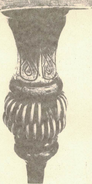
SCEPTER, KUBA. COPPER AND IRON 30cm. CAT. NO. 53