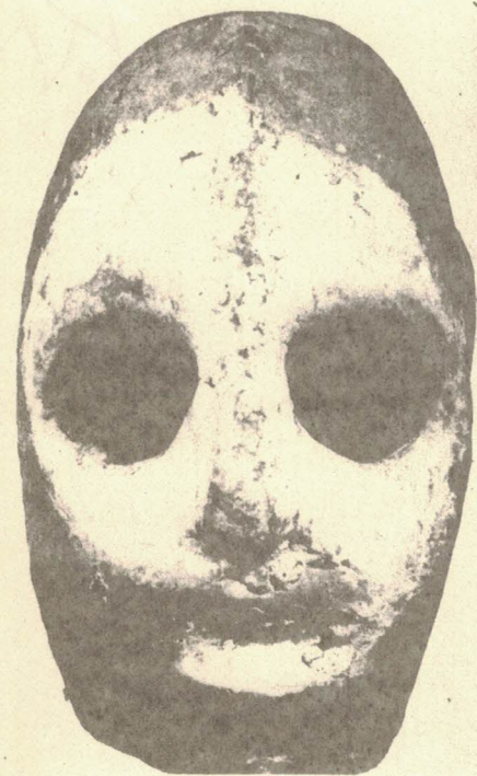
MASK, KOMO. WOOD, 26.8cm. CAT. NO. 96