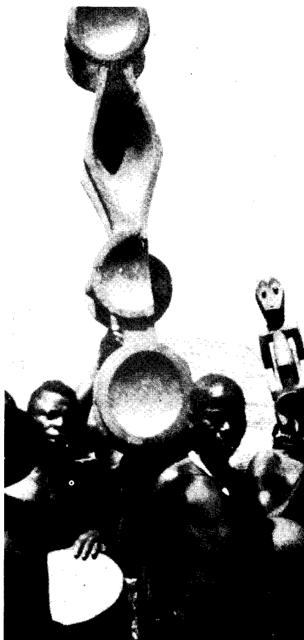
ABOVE: 1. KOMO FIGURINE, 75.9cm. MUSEE ROYAL DE L'AFRIQUE CENTRALE, Tervuren. RIGHT: 2. LENGOLA STOOL AND FIGURINE. PHOTOGRAPHIC ARCHIVES, MUSEE ROYAL DE L'AFRIQUE CENTRALE, AFTER R. P. DE JAEGER (1937).