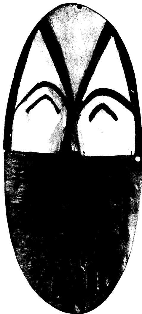
ABOVE: 5. MBOLE MASK, 45.9cm. MUSEE ROYAL DE L'AFRIQUE CENTRALE. LEFT: 6. PERE DOUBLE FIGURINE, 21cm. MUSEE ROYAL DE L'AFRIQUE CENTRALE.

In the existing literature on African art, little justice has been done to this vast region. The main emphasis has been on Lega, and occasionally on some of the other groups, especially Mbole. In general, the information provided is scanty and incomplete. Early works on the art of Zaïre, by Coart and de Hauleville (1906) and Maes (1935; 1938) have practically no information on the area. Maes (1935, pl. XVI) makes a hopeless confusion, ascribing to the Bemba and the