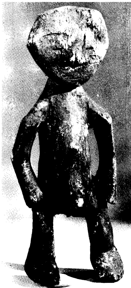
10. YELA FIGURINE, 40cm. MUSEE ROYAL DE L'AFRIQUE CENTRALE