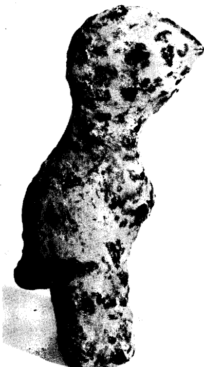
◀ OPPOSITE PAGE: 7. MBOLE FIGURINE USED BY LILWA SOCIETY TO REPRESENT AN OFFENDER AGAINST SOCIETY. 60cm. WELLCOME COLLECTION, UCLA MUSEUM OF CULTURAL HISTORY

All peoples in this area speak Bantu languages. Linguistically, however, they represent various subdivisions within the Bantu languages. According to Guthrie (1967, 1970), who has synthesized a great