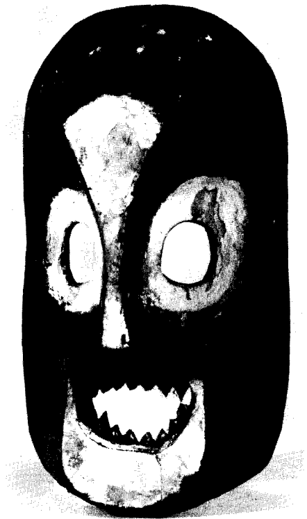
12. KOMO MASK, 33.2cm. MUSEE ROYAL DE L'AFRIQUE CENTRALE