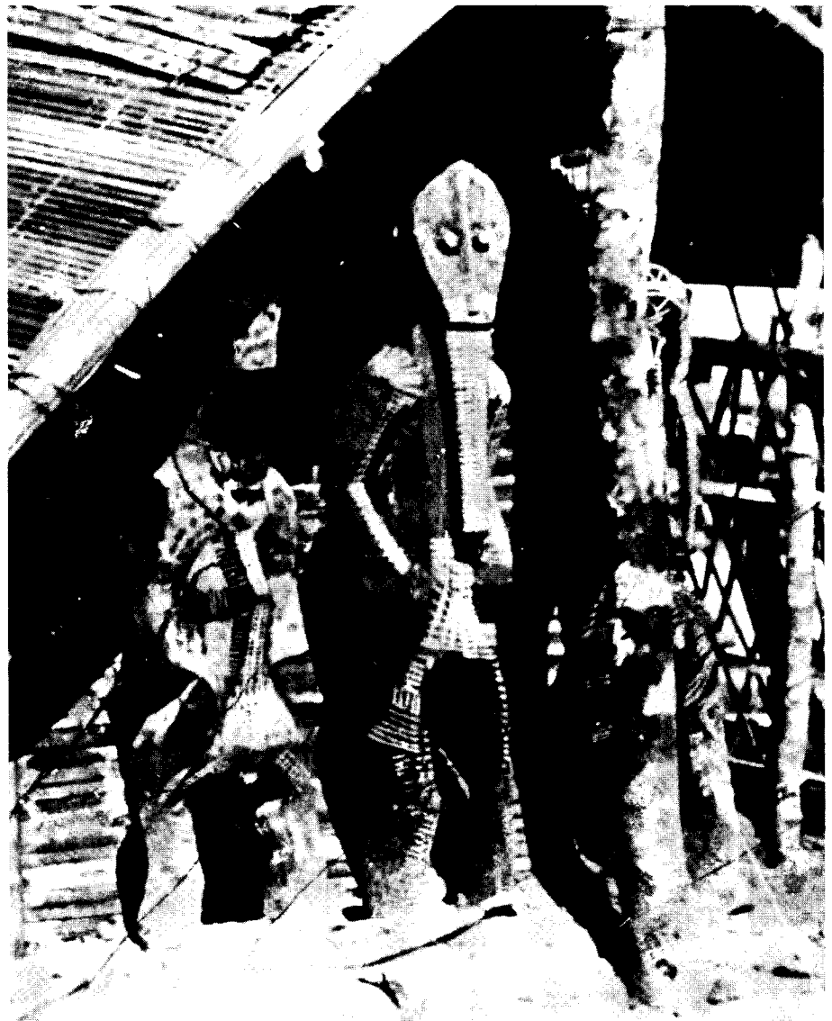
ABOVE: 8. MITOKO FIGURINES NEAR A HANGAR. LEFT: 9. PERE BIRD FIGURINE, 10.2cm. MUSEE ROYAL DE L'AFRIQUE CENTRALE.