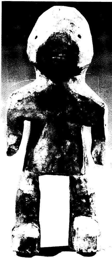
4. MBOLE FIGURINE, 41cm. MUSEE ROYAL DE L'AFRIQUE CENTRALE.

derive some of their art forms from them (Nyanga, Kwame, Hunde, Longola). Large figurines in wood are known among the Mbole, Lengola, Mitoko, Komo, and Kasingo, Zyoba, and Boyo. There is much work in wood of intermediate size among the Yela, Pere, Lega, and Bembe. The Mitoko carve tall notched poles adorned with a head or face. Among the taller figurines, there is a preference for slender figures among the Mbole, Lengola, and Komo, and for the heavier, more stocky ones among the Kasingo and Boyo; but groups like the Mitoko have both types.