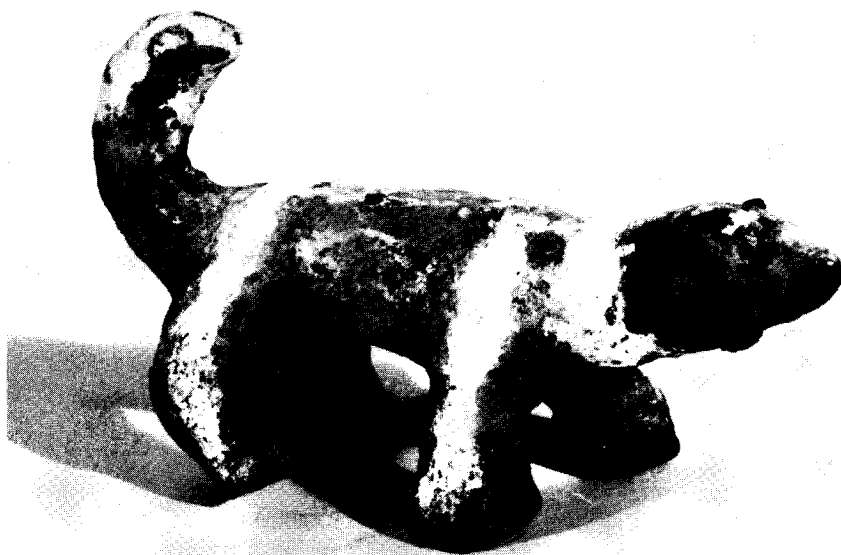
11. PERE ANIMAL FIGURINE, 13.5cm. MUSEE ROYAL DE L'AFRIQUE CENTRALE