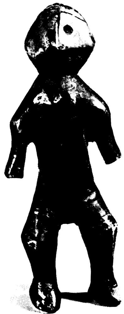
ABOVE: 13. LEGA FIGURINE IN IVORY, 14cm. COLLECTED BEFORE 1934. MUSEE ROYAL DE L'AFRIQUE CENTRALE. LEFT: 14. PERE MINIATURE STOOL IN CLAY, 7.8cm. MUSEE ROYAL DE L'AFRIQUE CENTRALE.