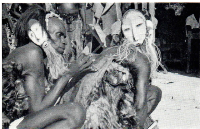
Fig. 3. Scene of nkunda rite.