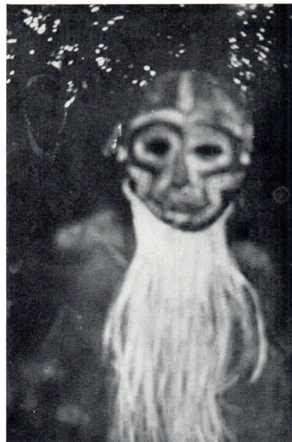
Fig. 2. Muminia mask worn during kongabulumbu initiations.