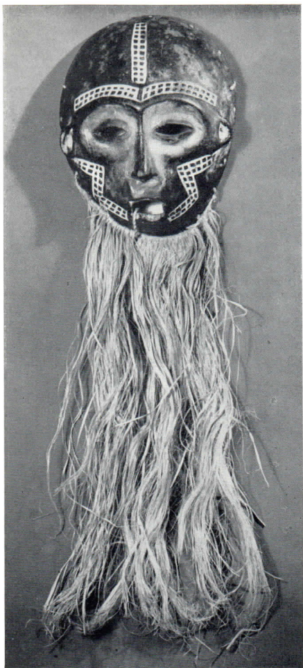
Fig. 1. Muminia-mask.