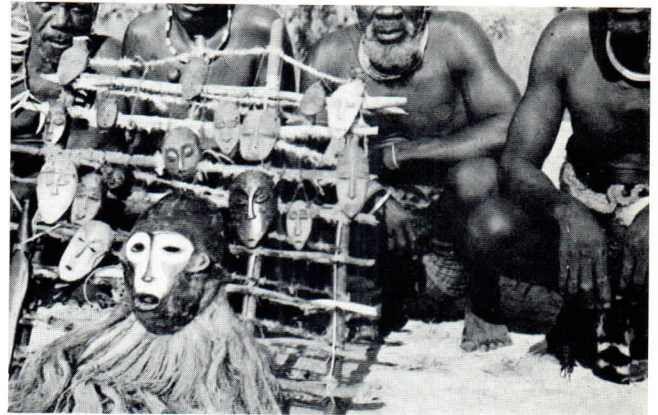
Fig. 6. Ivory masks and wooden muminia mask hung on a fence, during kèlènkumbi rites (Beianangi).