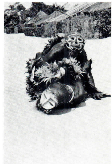
Fig. 8. Final scene of ibugèbugè rite.