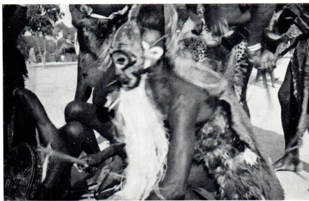
Fig. 4. Other scene of nkunda rite.