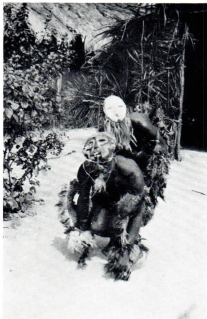
Fig. 7. Maskers, wearing muminia and idimu, during ibugèbugè rites.